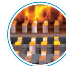
粉末烧结热处理 Sinter heat treatment