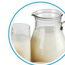
奶制品 Dairy products