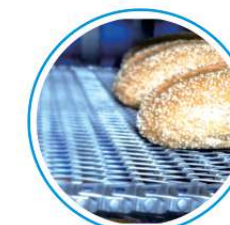
休闲食品和烘焙 Snack and bakery